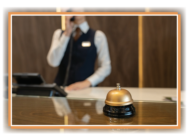
Cashiers are usually on this list, however this year with a mean wage of $14.42, they are not.