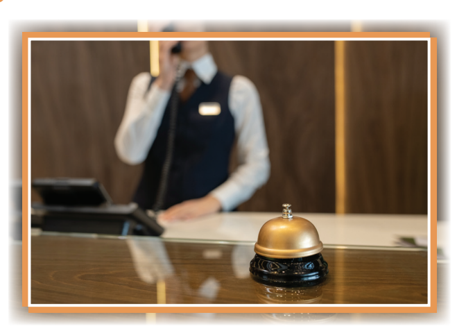
Cashiers are usually on this list, however this year with a mean wage of $14.42, they are not.