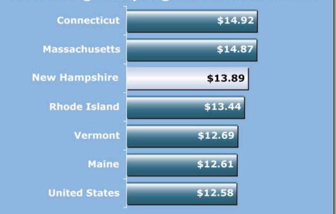
2005 Average Hourly Wage for Medical Assistants Comparing US to NH and its Counties