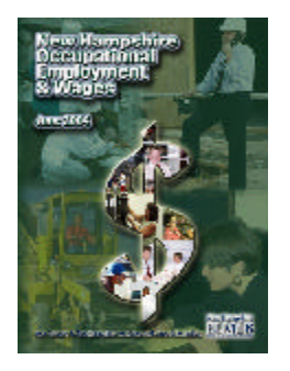
< www.nhes.state.nh.us/elmi >