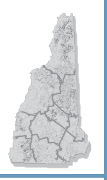
Published by New Hampshire Employment Security's Economic and Labor Market Information Bureau

Personal income is the income that is received by persons from all sources. It is calculated as the sum of wage and salary disbursements, supplements to wages and salaries, proprietors' income with inventory valuation and capital consumption adjustments, rental income of persons with capital consumption adjustment, personal dividend income, personal interest income, and personal current transfer receipts, less contributions for government social insurance. 1