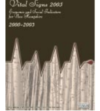
This publication is now available on our Web site at <www.nhes.state.nh.us/ elmi/econanalys.htm>